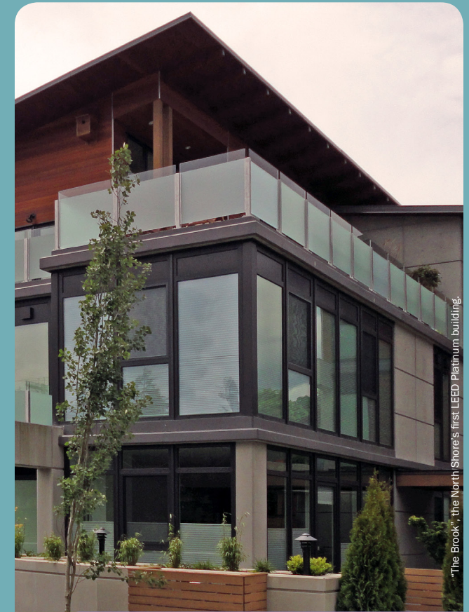
"The Brook", the North Shore's first LEED Platinum building