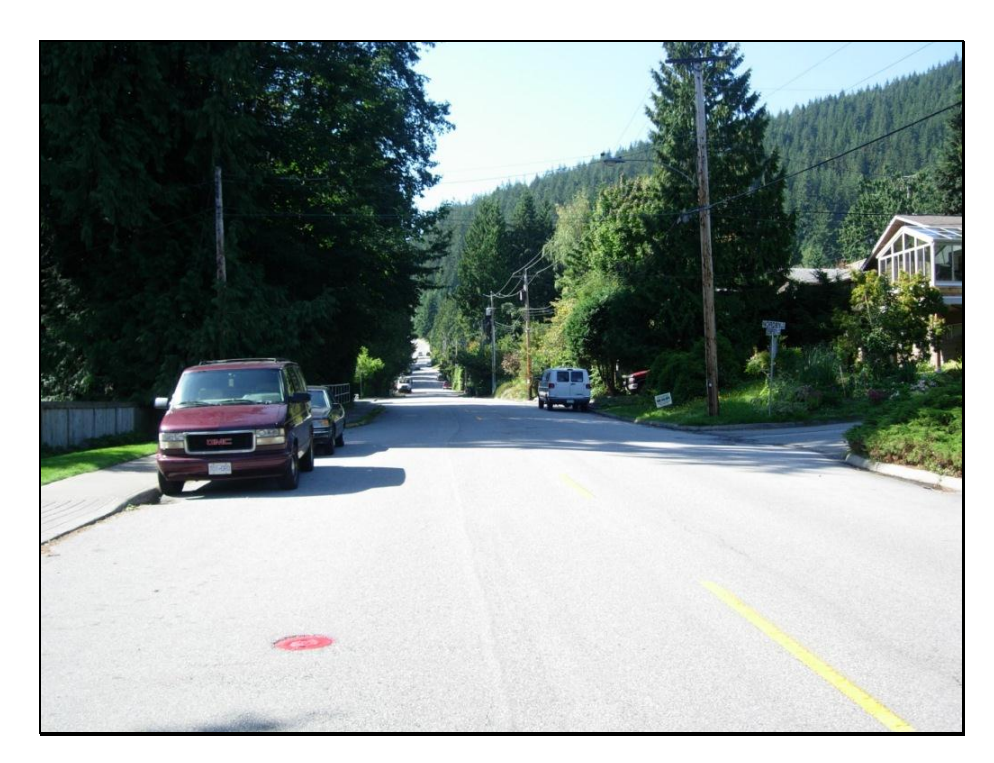
Exhibit 2: Dempsey Road, East of Mountain Highway

Minor Arterial Roads. Similar to major arterial roads, the function of minor arterial roads also focuses on traffic movement. With average traffic demand in the range of 3,000 to 10,000 vehicles per day in both directions, access to adjacent residential development on minor arterial roads is also possible. Parking on one or both sides can also be accommodated where there is sufficient roadway width. Examples of existing minor arterial roads include Delbrook Avenue, Highland Boulevard, and Montroyal Boulevard. Ross Road, currently a minor arterial road, is shown in Exhibit 2.