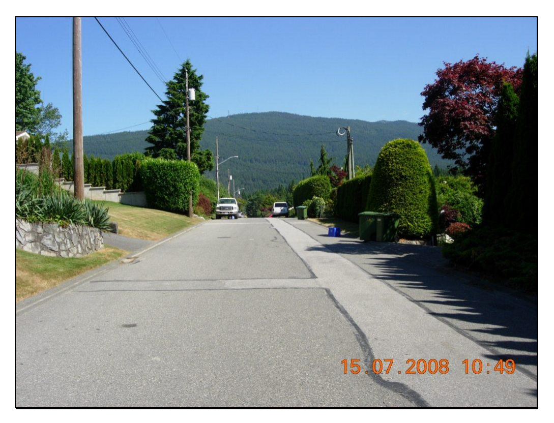
Exhibit 4: Beachview Drive

Local Roads. The primary focus of this road class is land access rather than traffic movement. Parking is usually available on both sides of the road except for a few local conditions. The volume is generally lower than 1,500 vehicles per day in both directions. Some local roads do not have a sidewalk on either side. Driveway access onto local roads is preferred over any other classes if opened public lanes are not available. Examples of local roads include Regent Avenue, Beachview Drive (Exhibit 4), and Anne MacDonald Way.