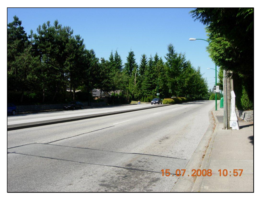
Exhibit 1: Mount Seymour Parkway, with raised centre median

Some examples of major arterial roads include Marine Drive, Capilano Road, and Mount Seymour Parkway (Exhibit 1). Regional roads designated by TransLink as Major Road Network (MRN) are typically in this class.