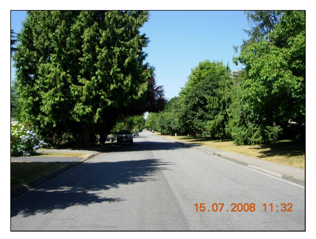
Exhibit 3: West 15<sup>th</sup> Street

Collector Roads. This road class equally supports both movement and access. It carries traffic volume between 1,000 and 8,000 vehicles per day in both directions. Depending on the width of the road, a collector road in the District usually provides for two travel lanes, and parking can be made available on one or both sides. Examples of collector roads include Fromme Road, Garden Avenue, and West 15<sup>th</sup> Street (Exhibit 3).