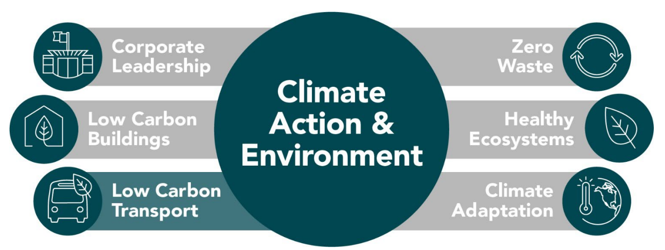
Figure 1: Climate action & environment key directions